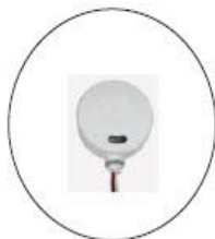
DIMMABLE MOTION SENSOR 120-277V