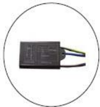
10KV SPD 120-277V