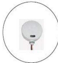
DIMMABLE MOTION SENSOR 120-277V