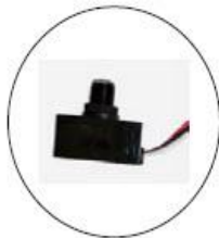
BUTTON STYLE PHOTOCELL 120-277V